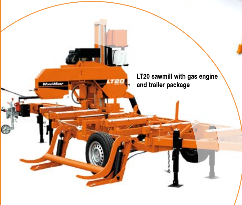
LT20 sawmill with gas engine and trailer package