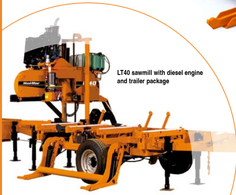
LT40 sawmill with diesel engine and trailer package